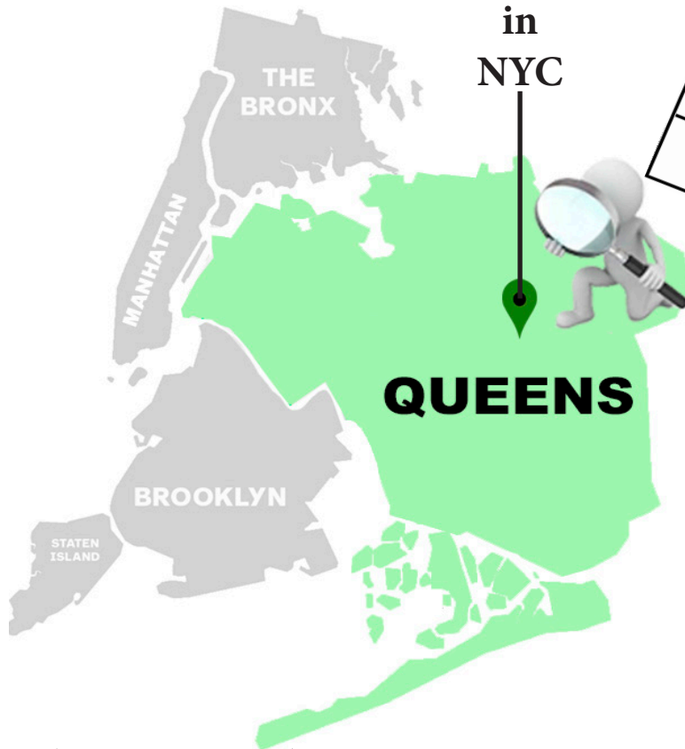
OUR 50 BLOCK CHURCH-NEIGHBORHOOD a typical NYC micro-neighborhood